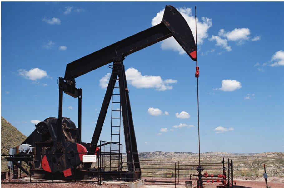
Non-renewable Petroleum Sources