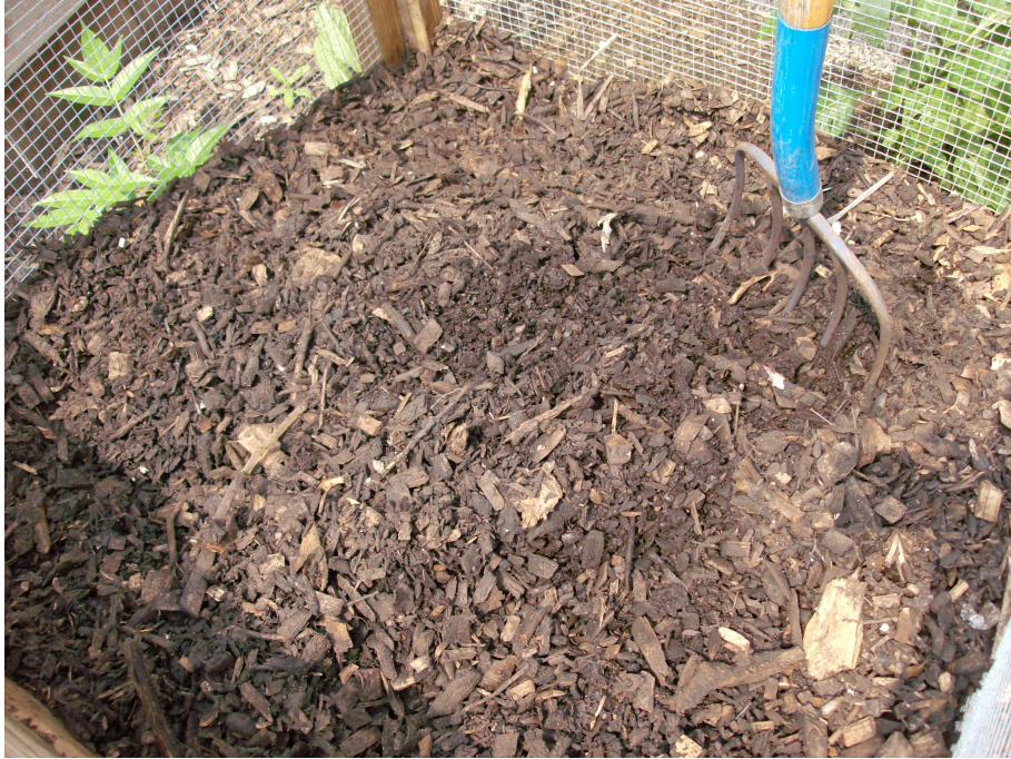
Biodegrades by Composting