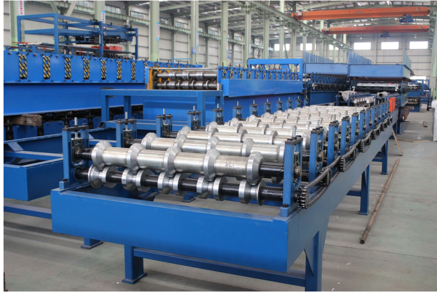
Multi-step Manufacturing Process